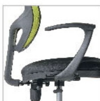
V ARMREST Design matched moulded polypropylene fixed armrest in black finish.