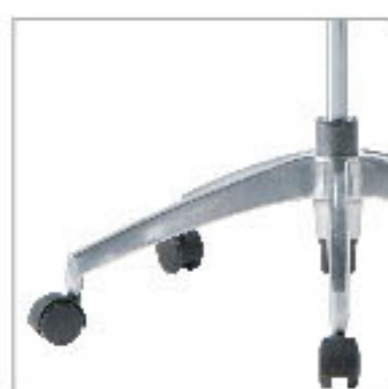
ALUMINIUM HIGH BASE 5 pronged die-cast Aluminium polished base.