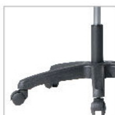
POLYPROPYLENE BASE 5 pronged polypropylene chair base with twin-wheel nylon castors.