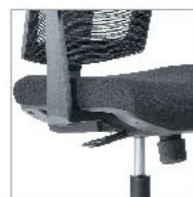
SYNCHRONIZED MECHANISM Synchronized mechanism with multi-locking system.