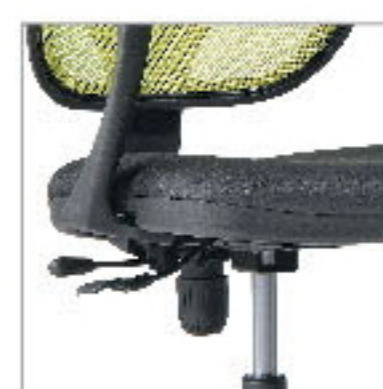
SWIVEL MECHANISM Swivel mechanism with one locking system.