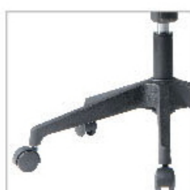
NYLON HIGH BASE 5 pronged nylon chair base.