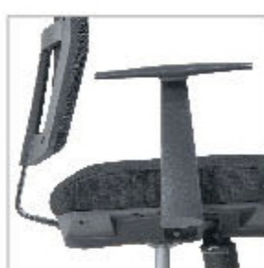
T ARMREST Design matched moulded polypropylene fixed armrest in black finish.